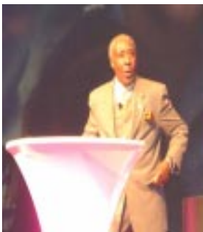
Former Principal Joe Clark (subject of Movie “Lean on Me.”)

Neil Howe , authority on generations in America, and Today’s Generation and the Work Force.